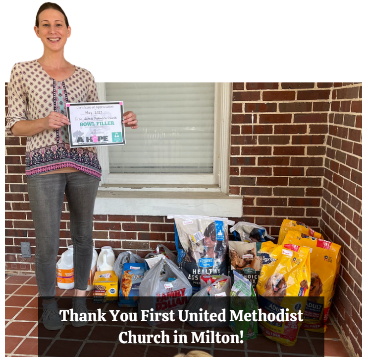
Thank You First United Methodist Church in Milton!